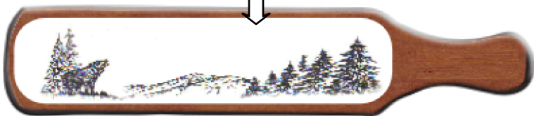
Art #4 Wolf & Mountain