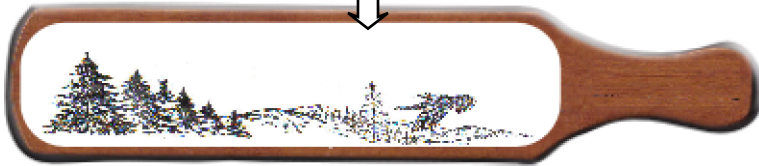
Art #3 Mountain Turkey