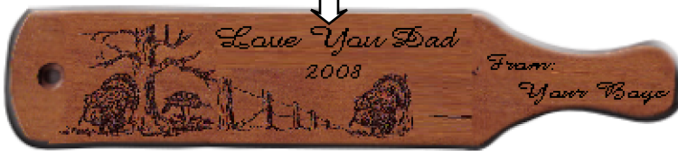
Art #1 Fence Turkey